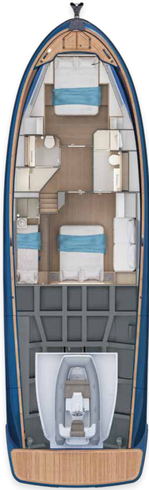
LOWER DECK Version A (standard)