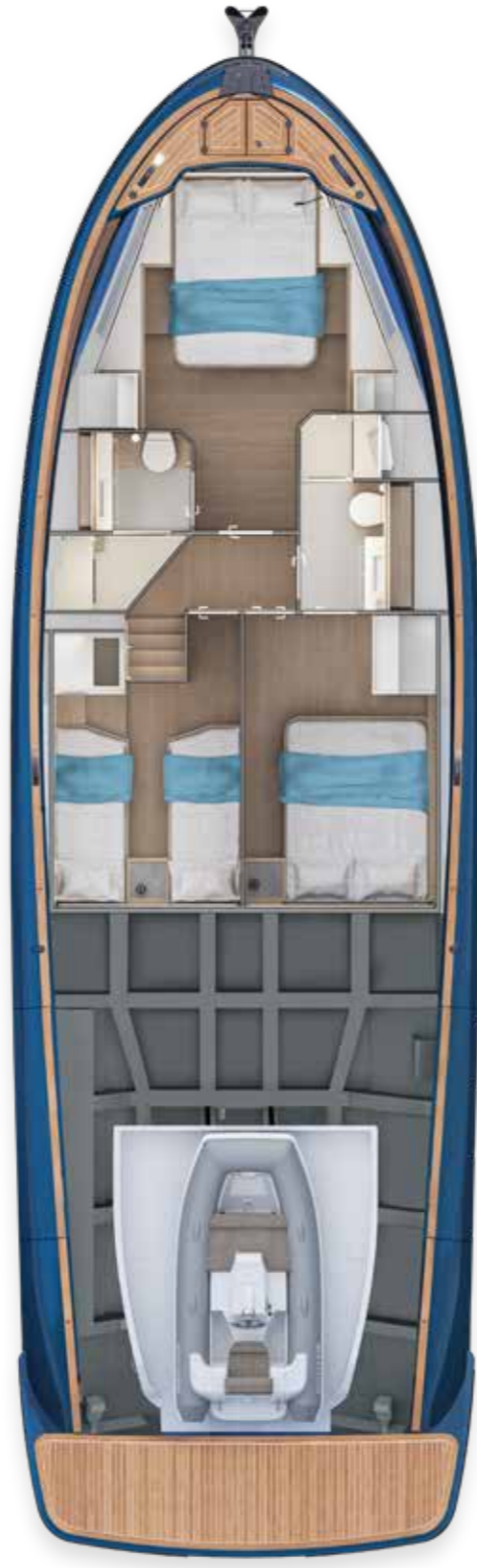
LOWER DECK Version B (optional)

EXTENSIVE LIVING AREA. THE KITCHEN IS EQUIPPED WITH A HOME-LIKE WORKING SURFACE.