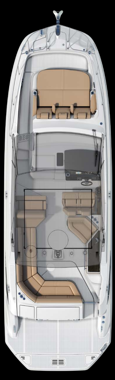
DECK / COCKPIT