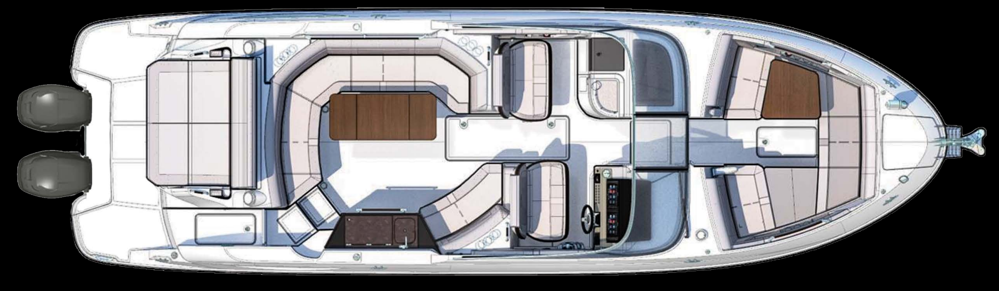
DECK / COCKPIT