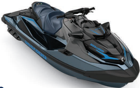
NEW Abyss Blue and Gulfstream Blue