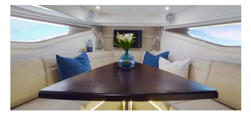
In the forward Salon / V-berth, a stylish table converts via filler cushion to form a comfortable full-sized bed. A deluxe head, gourmet-ready galley with extending countertops and generous storage round out this inviting space.