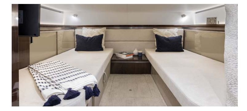
For ducking out of the elements or making an overnight or weekend-long getaway, the Sundancer 320 features a beautifully designed cabin with sleeping accommodations for four. In the mid-berth, two sliding twin beds can be combined to form a queen bed.

The cockpit affords effortless, versatile enjoyment of the water, with a natural flow from the helm all the way through the transom and onto the integrated swim platform. A reversible helm companion seat converts to face aft, facilitating conversation with the rest of the cockpit. A well-equipped standard wetbar includes a sink and storage, and offers a refrigerator and grill as options.