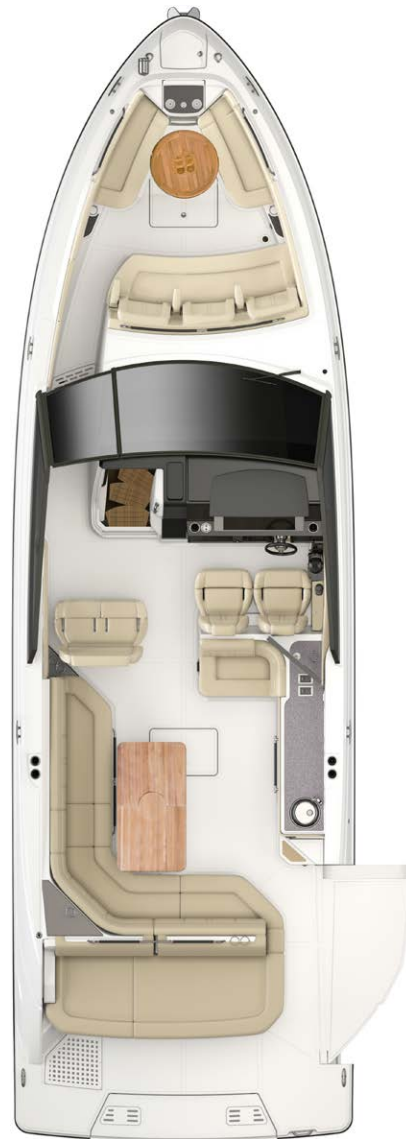
BOW & COCKPIT