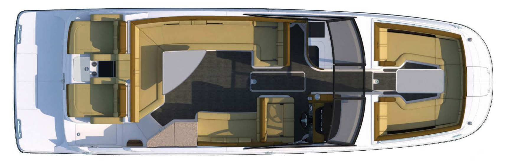
DECK / COCKPIT