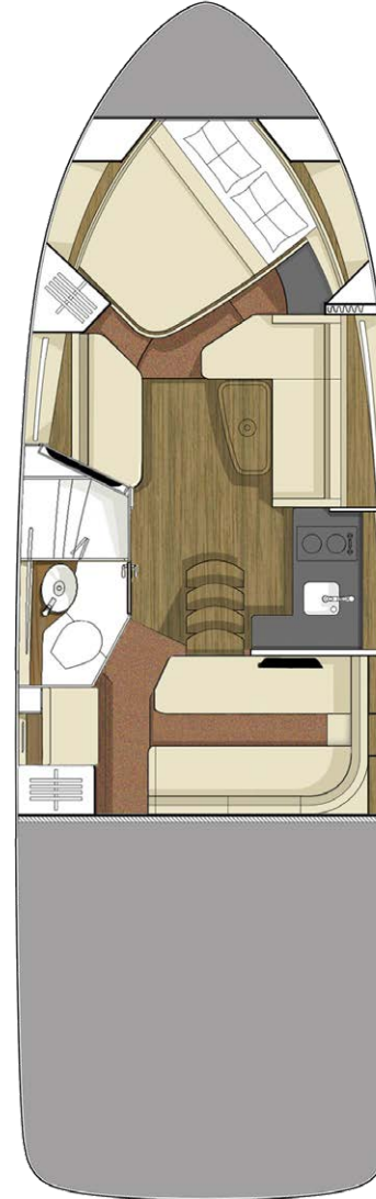
STANDARD CABIN LAYOUT