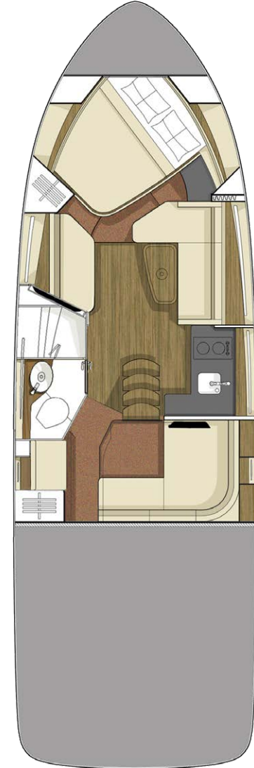
OPTIONAL CABIN LAYOUT

Shown with mid-berth 'L-shaped' seating (converts to sleeper)