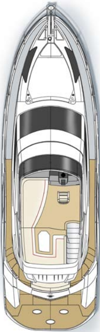
Single Helm Seat with Forward Sun Pad